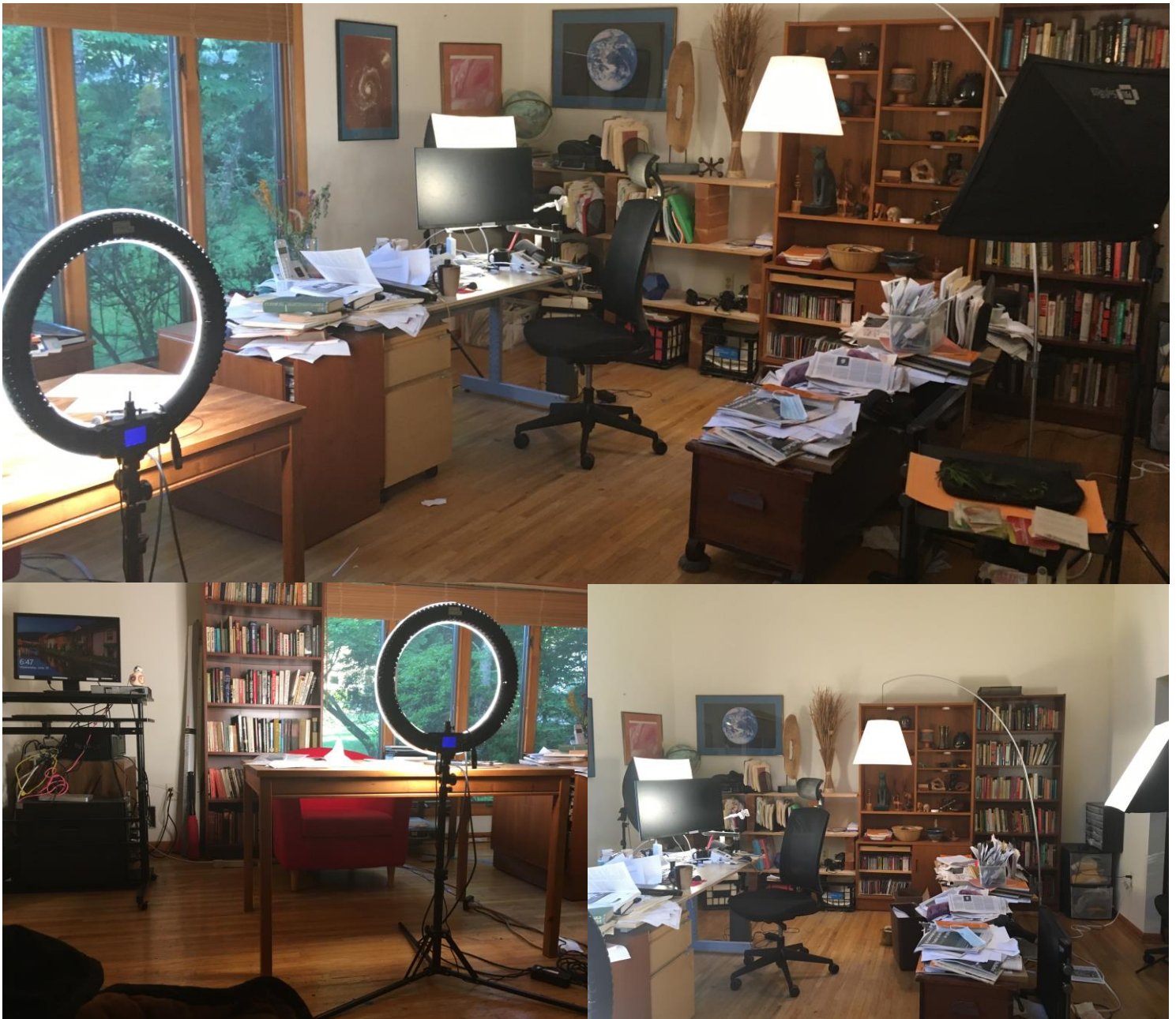
Fig. 3 Behind the scenes at LPPFusion Studios. Our LPPFusion home office's main room (top) serves as a work area for Chief Scientist Eric Lerner (responsible for messy papers); as a daytime video set (bottom left, with server station at far left) and as a nighttime video set (bottom right—excluding messy papers.)

While this hardware upgrade was going on, the IT team also updated the website with a new theme, new plugins and a new server operating system. This resulted in minor changes to appearances, but big changes in functionality including easier maintenance and improved social media sharing. Finally, the team redesigned and rewired our combined home office and video recording studio . This involved solving some tough lighting and audio quality problems, but it has given us two different sets in the same room, allowing us to record both day and night. If you watched our two new 2021 videos , we think you'll notice their improved quality.