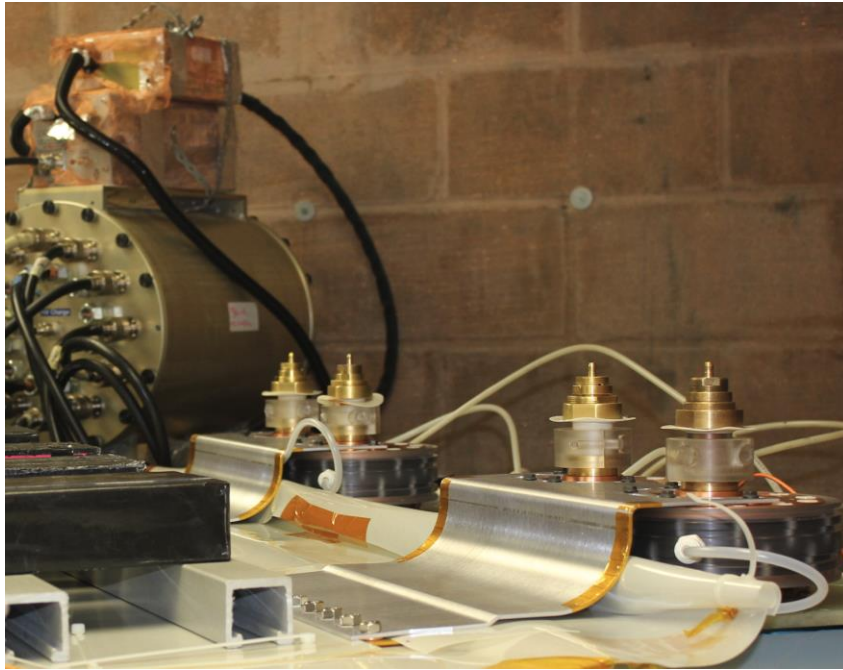
Fig. 2 The new dual switches during assembly of the switching system. The switches are the dark plastic cylinders, topped by the brass spark plugs. At this stage of assembly, they are not yet attached to the trigger system. The main trigger generator is the large brass cylinder to the left, with the trigger cables snaking out of it.

On June 10, we took the next step and tested the whole switch and trigger system by applying a charge to the capacitor bank. We wanted to make sure there were no flashover sparks before we made final preparations for a real shot, where we fire the capacitors, allowing huge currents to flow across our electrodes. Unfortunately, we did get a small flashover spark from one switch , right before we got to the full 40kV charge.