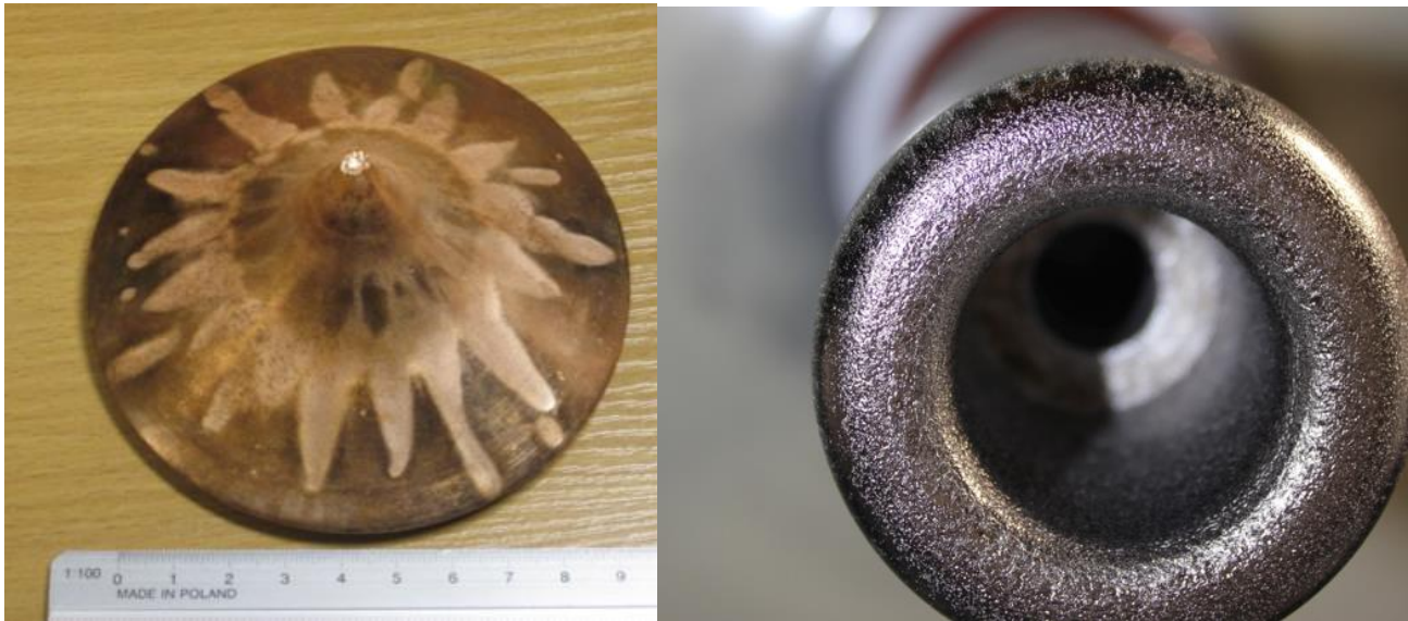
Figure 2. Erosion on anode tip of PF-1000 plasma focus device in Warsaw (left) shows evidence that it was generated by current filaments. Recombination radiation X-rays from tungsten impurities may have also caused erosion on FF-1 tungsten anode (right.)

erosion instead comes from high-energy particles leaking out of the plasmoid. But in Warsaw, Lerner saw anodes from the large PF-1000 plasma focus device that showed clear signs of erosion by the current filaments (dense vortices of current) prior to the formation of the plasmoid (Fig.2).