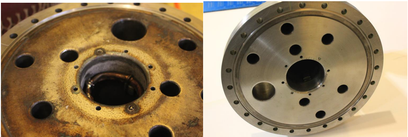
Fig. 1 The bottom of the vacuum chamber (which is also the top of the drift tube, attached at central hole) was eroded by ions beams and heavily coated with tungsten bronze after shots in September (left). After extensive lathing and polishing, the part is almost pristine and ready to be coated with titanium nitride (right).

The LPPFusion team worked in October to identify the key sources of oxygen. We had already identified the chromium oxide layer on the steel vacuum chamber as one source. Dr. Yee-Shi Chang, an LPPFusion investor and solid-state scientist, pointed out that the few-nm-thick coating could not account for the nearly 30 mg of oxygen we estimated was released in the chamber. One explanation for the greater amount is pervasive cracking of the steel surface. This could greatly increase its surface area and thus the amount of oxygen released from the chromium oxide layer (which reforms swiftly whenever stainless steel is cracked). To eliminate the cracked steel, the LPPFusion team worked with local machine shops and polished the steel surfaces, removing damage from years of use.