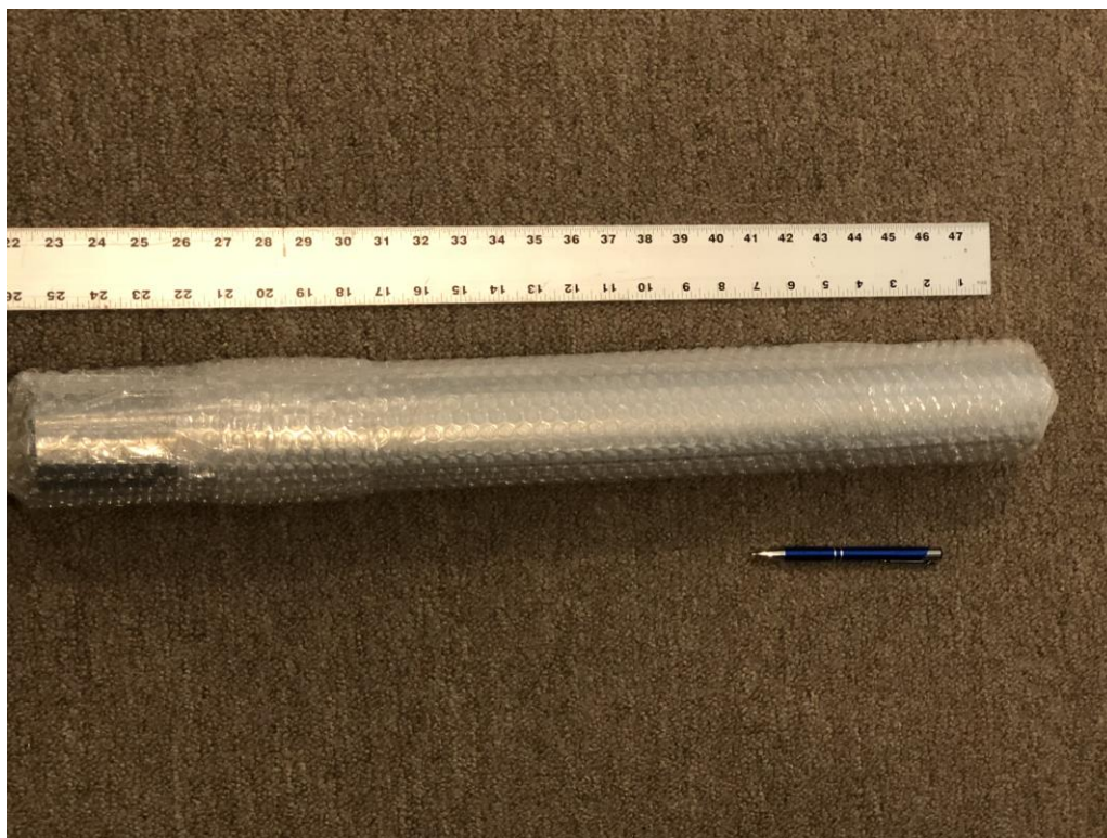
Fig 2. Our gleaming new beryllium cylinder sits safely in its plastic seal, ready to be machined into multiple anode shafts.

While preparing for our new beryllium parts, we've tested, with an outside safety lab, the dust in our lab to check our precautions against toxic beryllium dust. We were reassured, although not surprised, to learn that the lab could not find any beryllium at all, down to the detection level of 0.15\text{ng}/\text{cm}^2 . The lab also found no lead in our dust. Not only is our own safety assured, but this demonstrates that even a very small lab can handle beryllium electrodes safely.