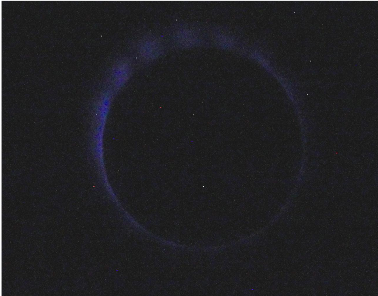
Fig. 1. Looks like a total solar eclipse, but it's not! This is a photo of the ghostly glow of preionization from the end of our tungsten anode. The anode is the black circle in the middle and the "corona discharge" from a tiny current is creating the violet glow around the anode. When we fire the machine, these ionized regions will smooth the path of the million-amp current, reducing vaporization from the anode and thus impurities in the plasma.

At the end of January we resumed firing FF-1. We expected that, with little or no oxygen in the chamber, we would not see a large increase in pressure, or pressure "pop," after we fired the first shot. (A small increase would happen just due to the increase in temperature.) But research is the realm of the unexpected, and the pressure after the first shot went up by 2 torr, or 5%, triple what we expected. We also saw in the optical spectrum from the shot the telltale bright line of oxygen at a wavelength of 775 nm. Where did this come from?