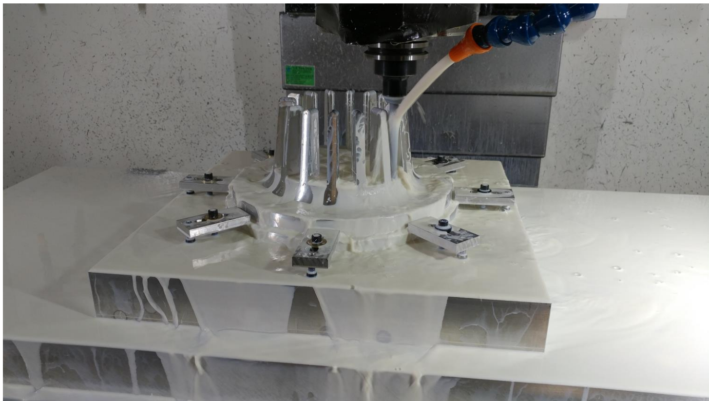
Fig. 4 Beryllium cathode for next experiment being machined at Hardric Lab. In Mass.

Once our current experiments with tungsten are complete, we will still need two or three months to prepare for the beryllium experiments. For one thing, our vacuum chamber will need a new coating of titanium oxide to coat over any remaining tungsten in the chamber. But with the electrodes soon to be in hand, we can be confident that the next set of experiments will be under way in the summer.