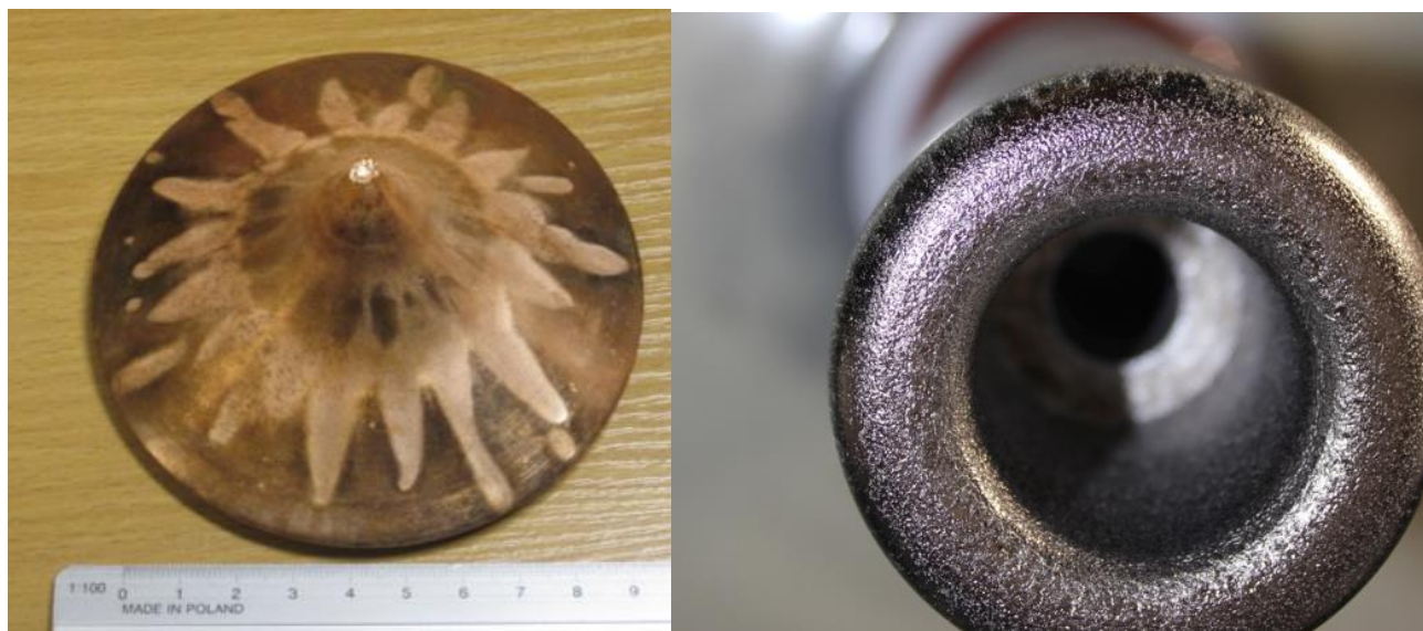
Figure 2. Erosion on anode tip of PF-1000 plasma focus device in Warsaw (left) shows evidence that it was generated by current filaments. Recombination radiation X-rays from tungsten impurities may have also caused erosion on FF-1 tungsten anode (right.)

erosion instead comes from high-energy particles leaking out of the plasmoid. But in Warsaw, Lerner saw anodes from the large PF-1000 plasma focus device that showed clear signs of erosion by the current filaments (dense vortices of current) prior to the formation of the plasmoid (Fig.2).