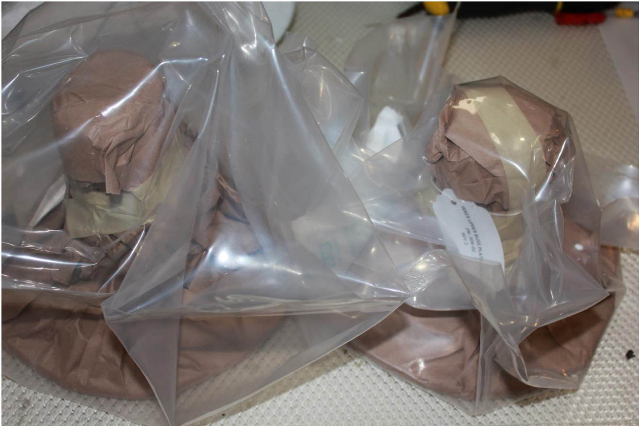
Figure 3. The 10-cm (left) and 7-cm (right) beryllium anodes in their sealed bags at LPPFusion's Middlesex laboratory await the arrival of the beryllium cathode in February.

only four electric charges each, the beryllium ions will have almost no impact on the plasma, so these electrodes will allow a complete test of the basic hypothesis that impurities have limited fusion yield in the plasma focus device.