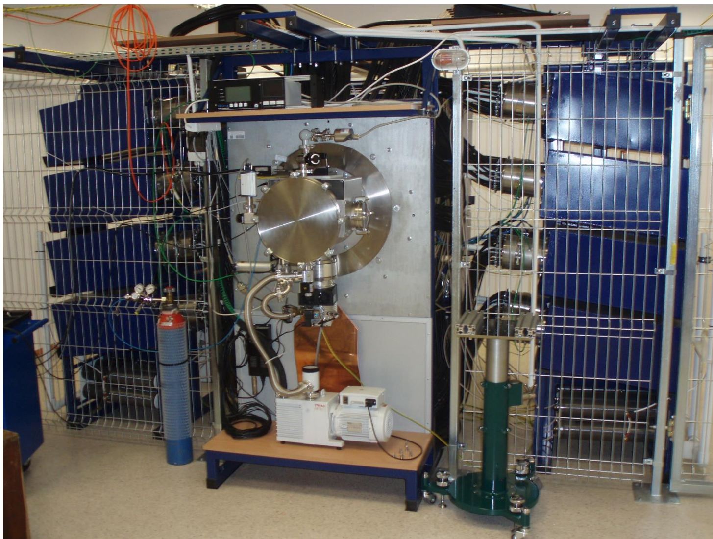
Figure 4. Institute of Nuclear Physics PF-24 plasma focus device in Krakow. The blue boxes are 24 capacitors, providing current to the electrodes inside the steel vacuum chamber (center).