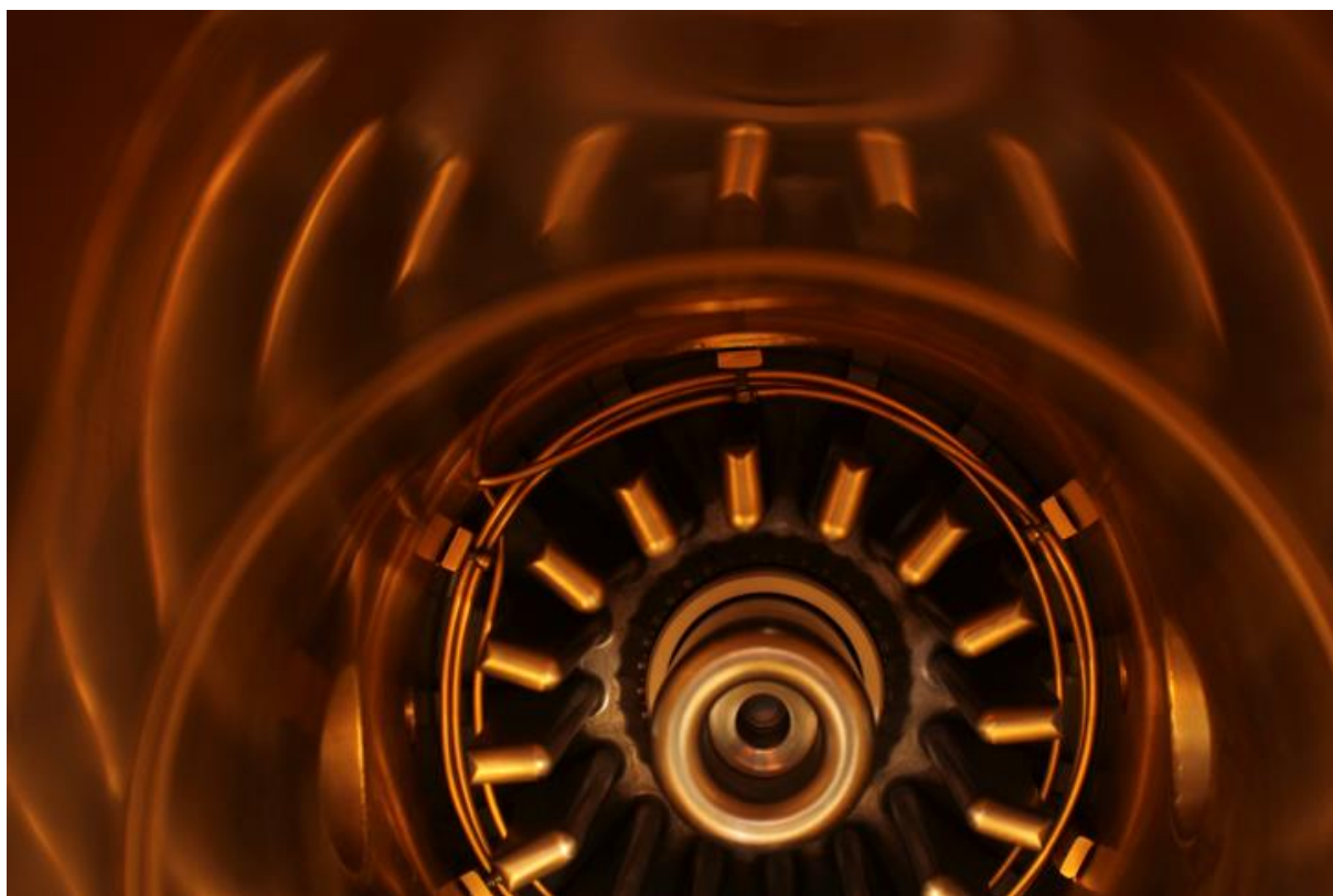
Fig. 3 While this view inside the vacuum chamber may look red-hot, the bake-out was actually nowhere near that. The red color results from the interaction of the golden color of the titanium nitride on the vacuum chamber and the camera's color correction software, but we thought it looked great. The inner anode is surrounded by the insulator, the vanes of the cathode and the axial field coil, which provides a small but vital initial magnetic field. For video of the initial assembly of the tungsten electrodes last year, please visit Focus Fusion Society here .