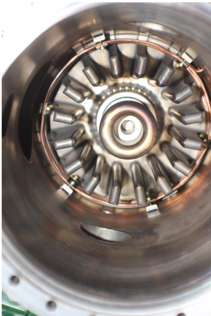
Oxide deposits (colored material) were still heavy after first shot on Sept. 9.

The solution is to replace the vacuum chamber inner surface with titanium or its compounds. Titanium is well known as an oxygen "getter", a material that grabs and hangs onto oxygen molecules. Since making an entire vacuum chamber from titanium would be costly and time consuming, we plan to line the present steel chamber with titanium. There are two ways of doing this: either brazing titanium sheets to fit inside the chamber, or coating the chamber with a thin titanium or titanium nitride layer. After consultation with suppliers, we decided on the coating, which will be done in the coming weeks. Then we can resume firing with the expectation of greatly reduced oxidation and resulting impurities in plasma.